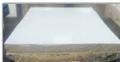
7-8 mm thickness